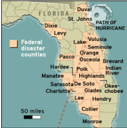
The path of Hurricane Charley traverses the state with Port Charlotte in its eye.

Program for Resource Efficient Communities | School of Natural Resources and Environment | www.energy.ufl.edu