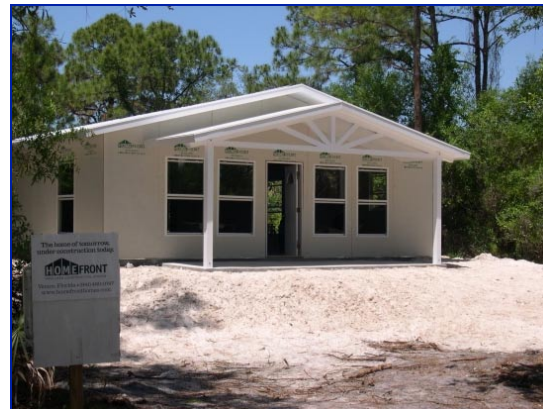
A Home Front, Inc. residence can be dried-in after about 3 days with a shell cost of approximately $25 per square foot.

SIPs can be used in walls, ceilings, floors, and roofs. SIPs provide a high R-value with the benefits of a high strength-to-weight ratio. Our case study home built by Home Front, Inc. in Sarasota County, Florida used a SIP system with wall panels made of a low-density foam core sandwiched between fiber cement board sheathing braced by an interior steel ridge beam. Home Front, Inc. also uses aluminum-skinned SIPs for their roofs.