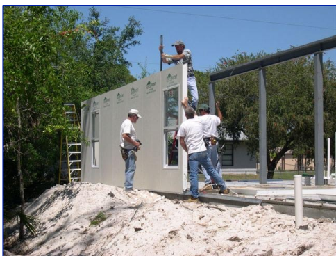
A four man crew can quickly and easily install the Home Front, Inc. SIP walls.