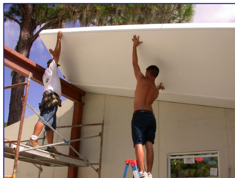
SIPs can also be installed as roofing or flooring systems.